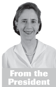
From the President